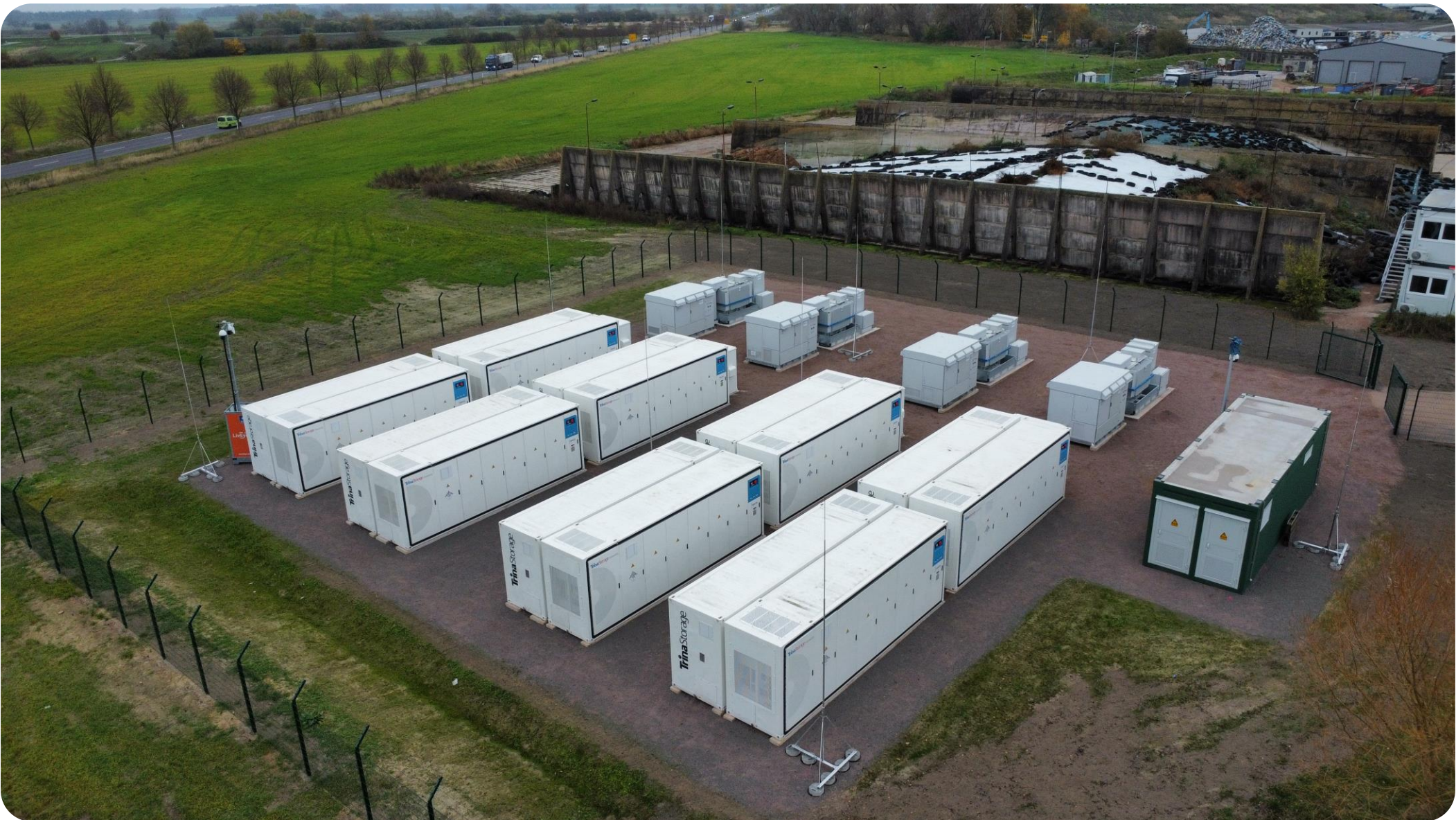
Site: Tangermünde, Sachsen-Anhalt, Germany