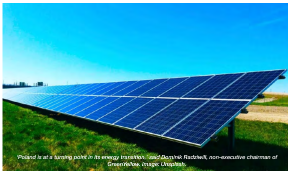
'Poland is at a turning point in its energy transition,' said Dominik Radziwill, non-executive chairman of GreenYellow.

French renewables firm GreenYellow plans to invest €100 million (US$116 million) in Poland over the next three years to expand its installed capacity and customer base.