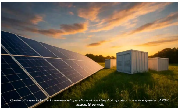
Greenvolt expects to start commercial operations at the Høgholm project in the first quarter of 2026.

Independent power producers (IPPs) Greenvolt and European Energy have finalised financial deals for solar-plus-storage projects in Denmark and Latvia, with the former raising funds from Ringkjøbing Landbobank and the latter divesting from its project.