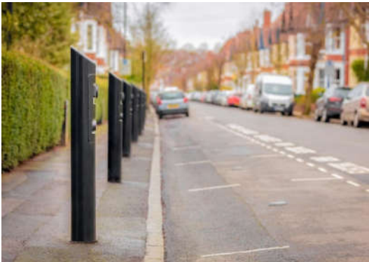
Photos of installed ORCS in Coventry City